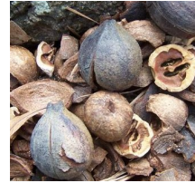
Pignut Hickory Nut