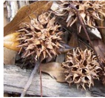
Sweetgum Seed Pod