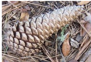
Loblolly Pine Cone