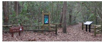
Start of Nature Trail