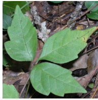
Poison Ivy- Do Not Touch!